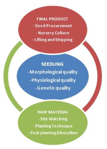
Figure 2. Seedling quality

The overall seedling quality is a function of morphological, physiological, and genetic quality (Fig. 2).